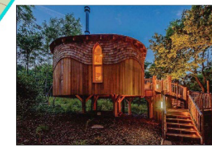
TYPICAL TREE HOUSE